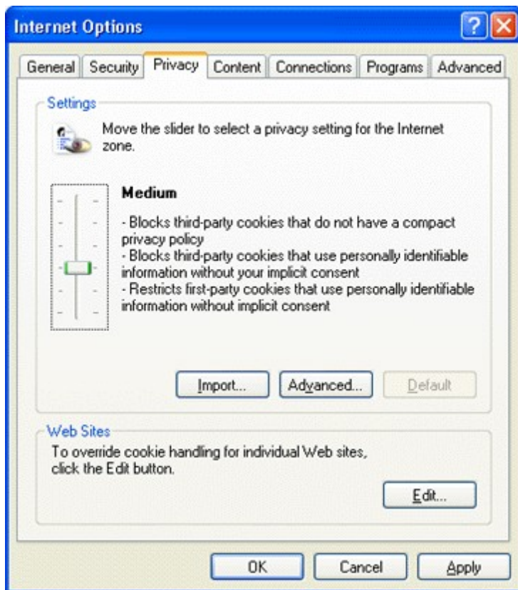
Figure 1. Adjusting cookie settings.

Internet Explorer 6 enables you to control whether cookies are accepted, based on your privacy preferences and the Web server's privacy policy. If cookies are sent by a Web server without a privacy policy, or by a server with a policy that does not match your preferences, those cookies are rejected and you are alerted to this event. You can control what privacy policy is required for cookies to be placed on your computer by changing the settings in the Privacy tab of the Internet Options dialog box as shown in Figure 1 below.